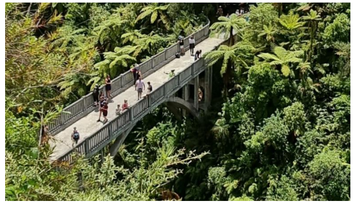
Jetboat the Whanganui River to The Bridge to Nowhere