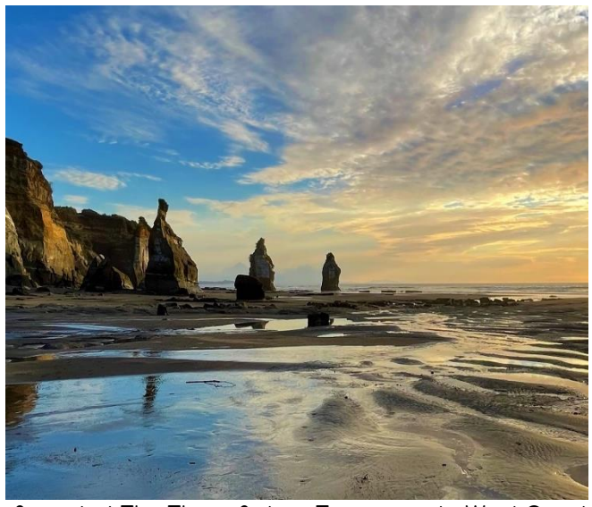
Sunset at The Three Sisters Tongaporutu West Coast