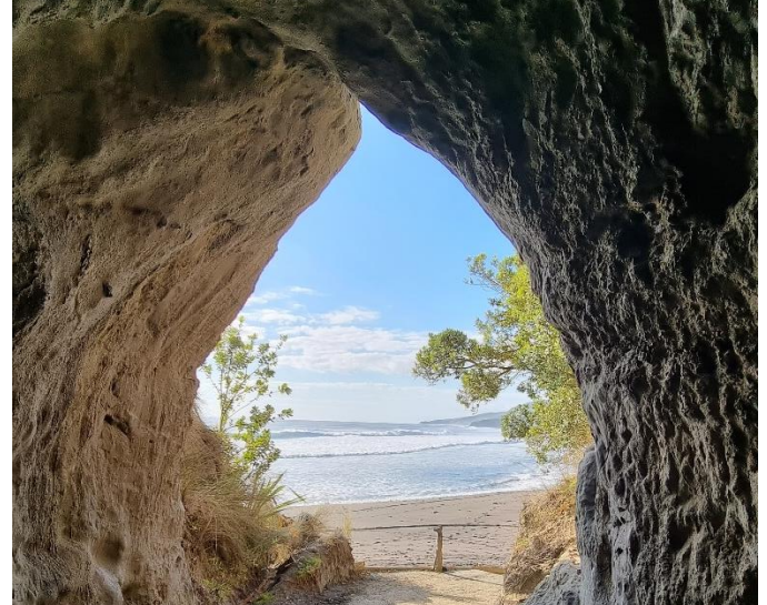
Waikawau tunnel on the West Coast