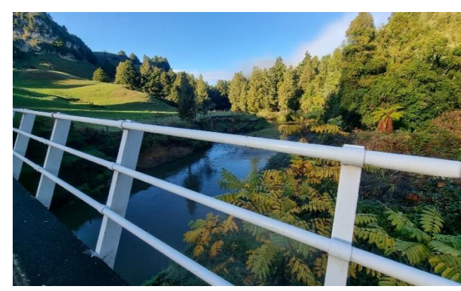
The Mangaotaki Bridge