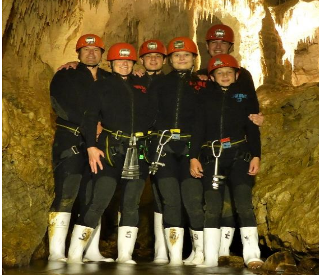
Waitomo Caves, Our family, Haggis Honking Hole